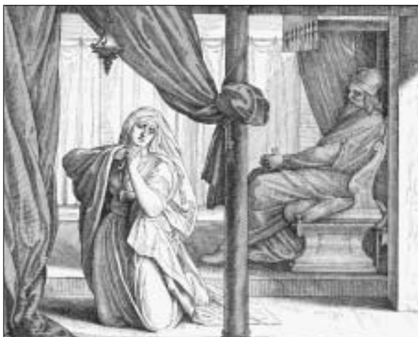
1 Samuel 1:10—Hannah’s prayer was a bitter but hopeful cry for help.

Julius Schnoor von Carolsfeld. Hannah’s Prayer. 19th century. Woodcut. Das Buch der Bücher in Bildern.